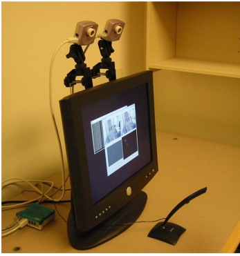
Figure 4: Experimental Setup. Study participants were seated in front of a GWINDOWS-enabled display and an open microphone for speech recognition.

GWINDOWS interface by manipulating five Internet Explorer windows, some of which contained the answers to the questions. These windows were placed on the display by the experimenter. The participants were asked to answer the questions in any order and without any time constraints. The questions were: (1) What is the weather forecast for tomorrow? (2) What is playing at the Crossroads 8 cinemas? (3) What is the top story on the New York Times?