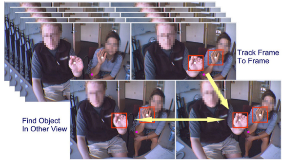
Figure 2: Object hypotheses (indicated by square solid colored dots on the image) are supported by frame to frame tracking through time in one view and stereo matching across both views

Unlike many other computer vision algorithms, the algorithm does not rely on fragile appearance models such as skin color models or hand image classification schemes which are prone to break when environmental conditions change or when the system is confronted with a new user. This robustness comes at a cost of relying on application constraints to determine which of multiple object hypotheses to select as the true object of interest. We believe that this is a valuable